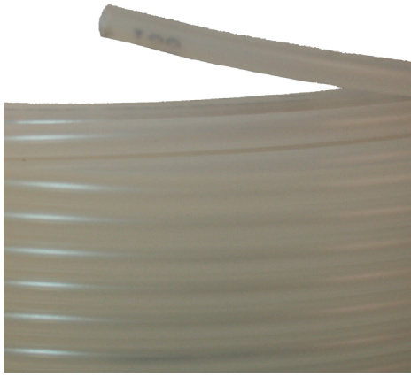
Metric Flexible Nylon Tube 30mtr Coils - Natural