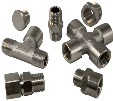
Male Adaptor BSPP - Equal

Media : Compressed air, water, oils and fluids in general for hydraulic and pneumatic fields