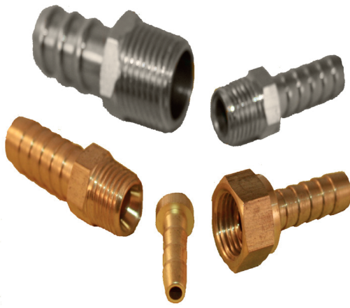
Brass Hose Tail BSPT

Media : Compressed air, water, oils and fluids in general for hydraulic and pneumatic fields